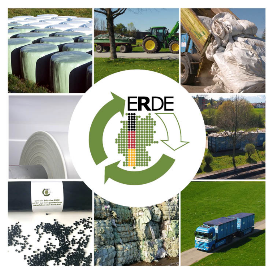
Fig. 1. Environmentallyaware farmers and agricultural contractors use the ERDE service and transport their used, roughly cleaned agricultural films to the collection points offered all over Germany. A recently finished video shows how ERDE works and how the process continues. The films collected are pressed into bales in waste disposal plants, before recycling companies process them into granules that can be made into new products in a sustainable wav.

Wiesbaden, September 2018 – The number of manufacturers and importers involved in the ERDE Recycling initiative continues to grow, and more and more farmers and agricultural contractors are also using an ever-increasing number of collection points and direct collections to feed used agricultural films into environmentally-friendly recovery and recycling systems. A new video now shows how simple ERDE is and which steps follow collection to complete the material cycle.