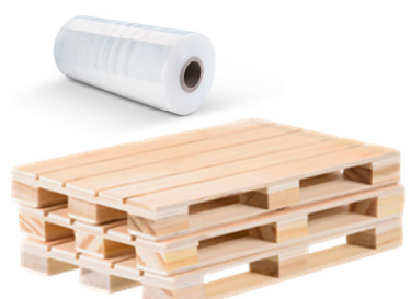
Wooden and plastic one-way pallets Stretch films, shrink films